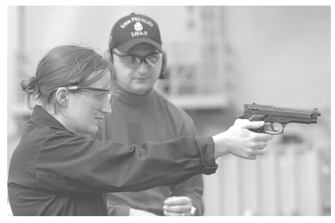
Military weapons training: the police and the military are allowed to carry weapons for protection and to keep law and order. But why does the public also need guns?